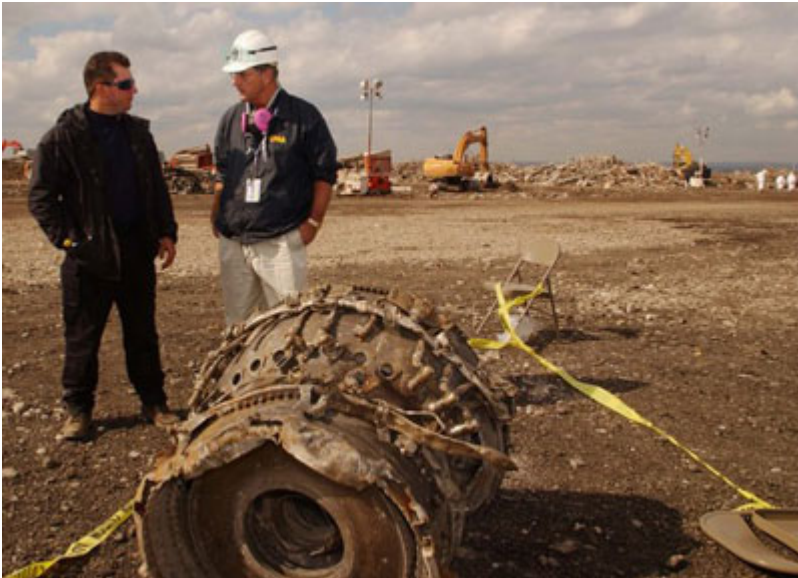
“Boeing” jet turbine at Fresh Kills island landfill.

What happened with Building 7 is incredibly suspicious. I have video that shows how curiously small the rubble pile was, and how the buildings to either side were untouched by Building Seven when it collapsed. It had not been hit by an airplane; it had suffered only minor injuries when the Twin Towers collapsed, and there were only small fires on a couple of floors. There’s no way that building could have imploded the way it did without controlled demolition. Yet the collapse of Building 7 was hardly mentioned by the mainstream media and suspiciously ignored by the 911 Commission.