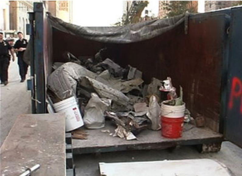
Rubber landing-gear tyres visible in evidence container marked "FBI Plane Parts Only."

We are asked to believe that all four of the "indestructible" black boxes of the two jets that struck the twin towers were never found because they were completely vaporized, yet I have footage of the rubber wheels of the landing gear nearly undamaged, as well as the seats, parts of the fuselage and a jet turbine that were absolutely not vaporized. This being said, I do find it rather odd that such objects could have survived fairly intact the type of destruction that turned most of the Twin Towers into thin dust. And I definitely harbor some doubts about the authenticity of the "jet" turbine, far too small to have come from one of the Boeings!